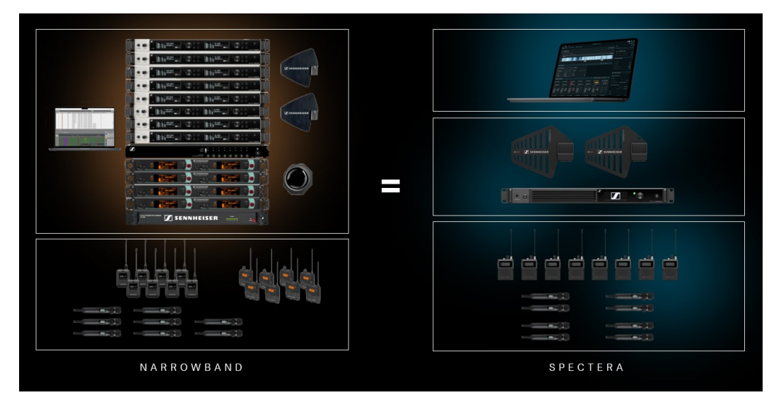
Typical narrowband setup and its Spectera wideband equivalent

Efficiency gains result mainly from bidirectionality, these would comprise remote control and management without additional infrastructure, flexible device configuration, intelligent transmitters, dynamic resource allocation within the RF channel, but certainly also the improved workflows and time savings for the operator.